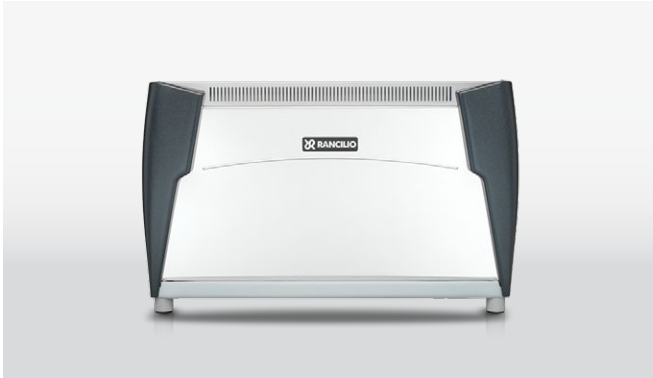
EpoCa S - 2 groups - rear view