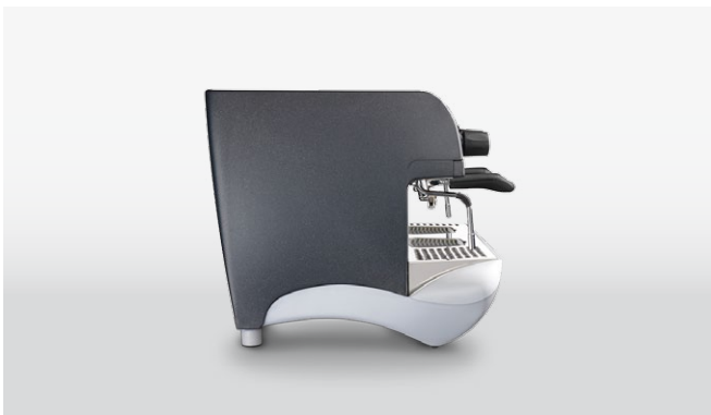
EpoCa S - 2 groups - side view