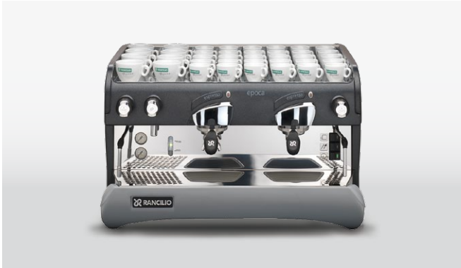
EpoCa S - 2 groups - front view