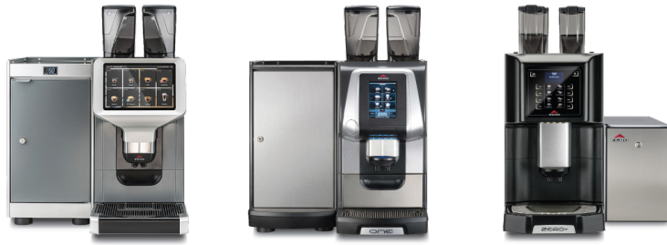
NEXT Top Milk