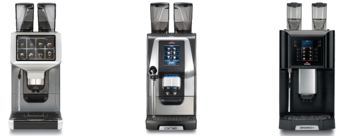
NEXT Pure Coffee