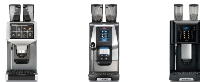
NEXT Pure Coffee