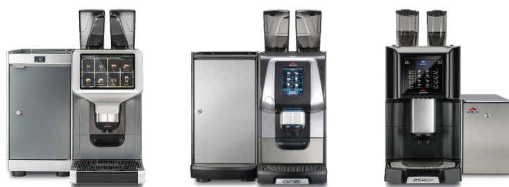
NEXT Top Milk