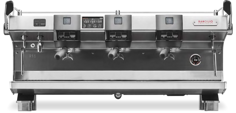
RS1 3 Group $19,800