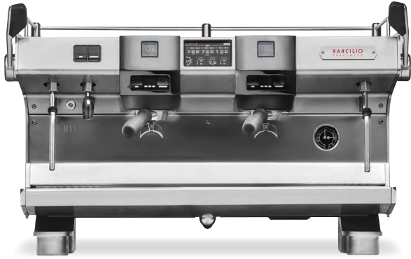
RS1 2 Group $16,600