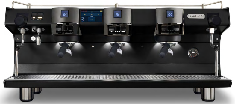
Invicta 3 Group $13,900