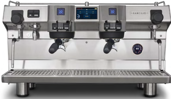
Invicta 2 Group $11,700